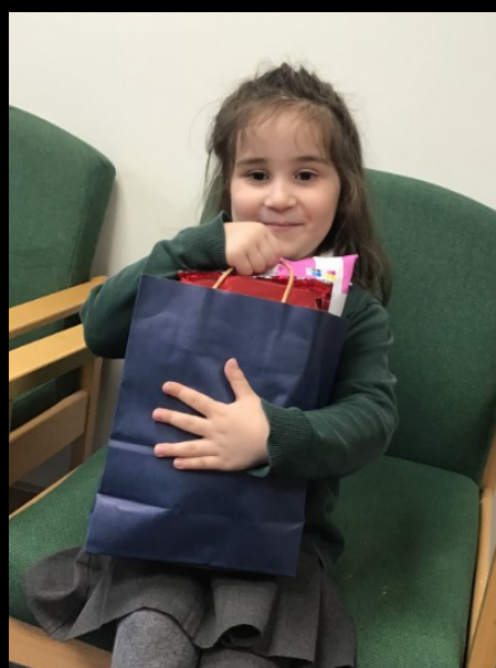
We gave her a gift bag for 100% attendance this week!

Our highest class attendance this week was 4H with 100% They will have a treat next week and an additional playtime. Well done!