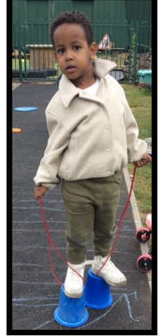
I made my own balancing scales!