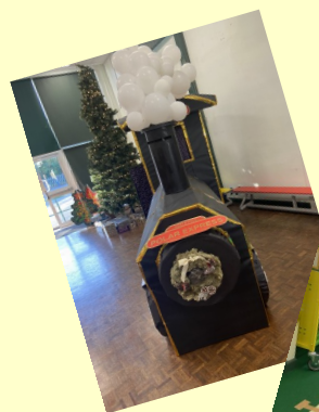
The Polar Express